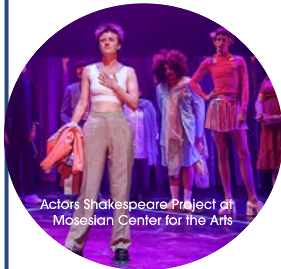
Actors Shakespeare Project at Mosesian Center for the Arts