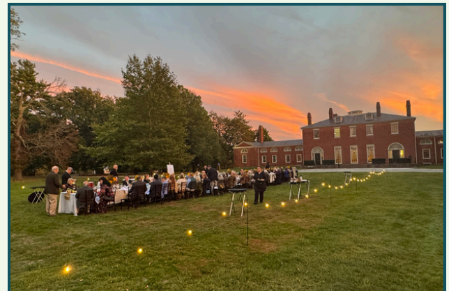
Our Farm to Table dinner at Gore Place with cocktails in the Threshing Barn and a dinner on the North Lawn at sunset.