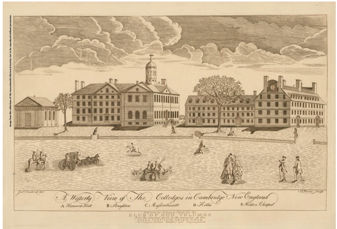
A westerly view of the colleges in Cambridge New England engraved by Sidney L. Smith for the Club of Odd Volumes from the original print Massachusetts Historical Society collection.

FOLLOW US @GOREPLACE ON INSTAGRAM AND FACEBOOK