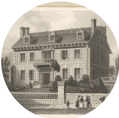
Hancock House, Boston