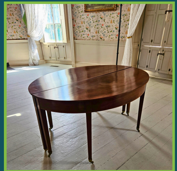
The Samuel Gore Table in three different configurations