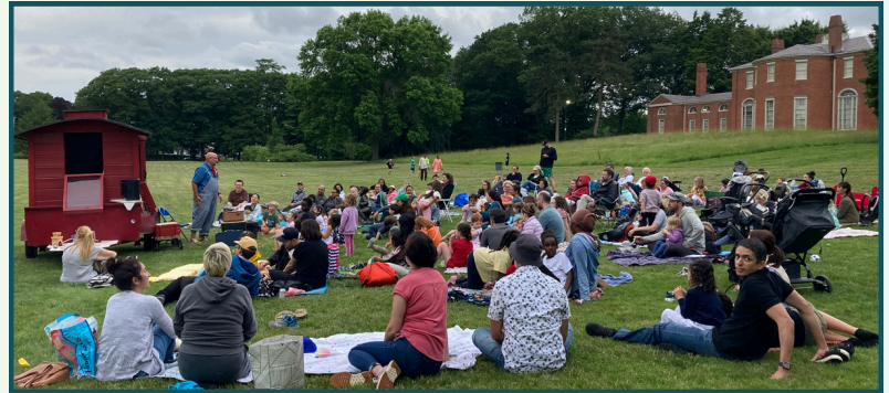
New children's programs this summer: Bubbles at the Barnyard and Puppet Show Picnic