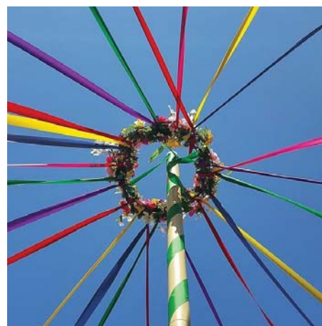
Top of the Maypole at the Sheepshearing Festival